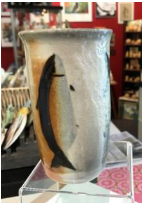
He has already caught some beautiful images. TAC