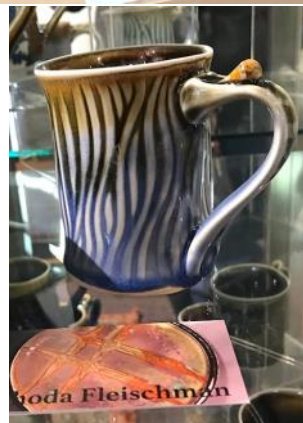
Rhoda Fleischman shares the beauty of rhythm and watery flow in this special cup. TAC