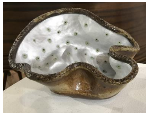
Suzanne Getz, Of the Sea