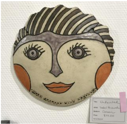
Isabel Prusinski, Undaunted