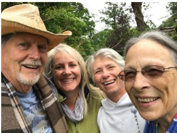
Hypertufa gang at Rhoda's

•Benton Center Pottery Sale June 14 3:30– 6:30 always lots of good stuff. Get there early!