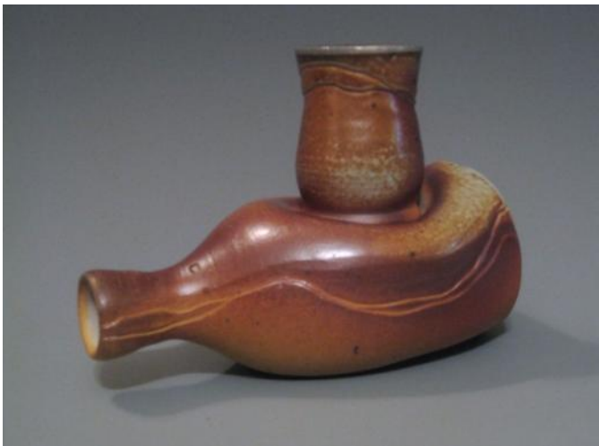
Woodfired Flask set - the collaborative endeavor of Lynda Farmer and Renee McKitterick